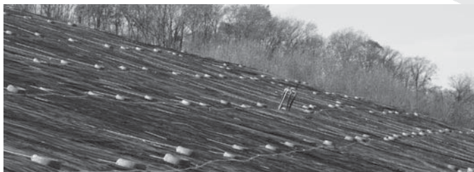
Temporary Rain Shed Cover

DURA-SKRIM 8BB, 8WB , are available in a variety of widths up to 125,000 square feet and up to 80,000 square feet in 12BB and 12WB . All panels are accordion folded and tightly rolled on a heavy-duty core for ease of handling and time-saving installation.